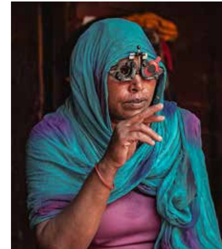
Woman getting her refraction checked by an Aadya screener.

The Aadya Initiative brings vision screeners and mobile technology to the very doorsteps of the rural poor. By training teams of women to conduct door-to-door screenings using a custom-built smartphone screening survey, Aadya is reaching significantly more people in less