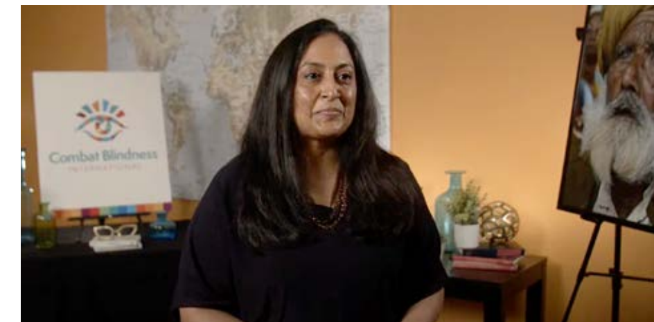
Watch a recording of our World Sight Day livestream at combatblindness.org/world-sight-day .

We are deeply grateful to all who joined us and gave from their hearts.