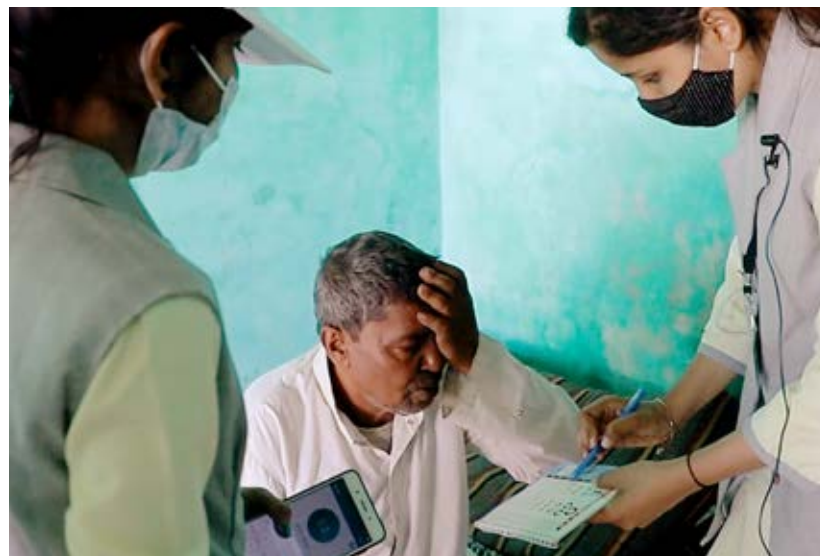
The Aadya Initiative promotes access to eye health and empowers women.